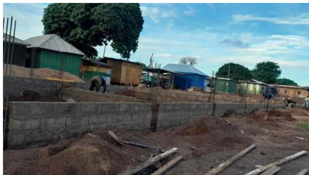
Yendi Store Complex Building Site

Please plan to attend our annual Spaghetti Dinner with all the proceeds benefitting the Ghana Partnership on Wednesday, November 1st at 6:00 pm. The Ghana Partnership has regularly kept in touch via zoom meetings and emails. Currently in Ghana they are continuing work on a Land Development project in Yendi. They are redeveloping a building and making it into a 10-store complex. The Church would run two stores (Bookstore and Agricultural Supply Store) and rent out the other 8 stores. This will provide an on-going source of income for the Yendi Congregation and the Presbytery. Our Presbytery Ghana Partnership just sent $9,000 to help with this project. In addition, they also sent 6 new motor bikes. These motorbikes allow Pastors to visit and care for their congregations, which are spread over long distances, and challenging road conditions. Our financial contributions help make this support possible! Please make plans to attend this delicious dinner and support our wonderful partnership!