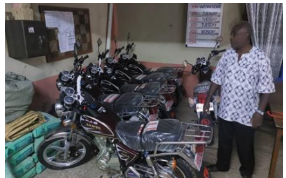
New motorbikes for Pastors